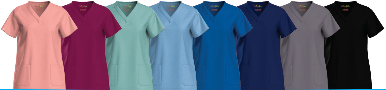
Blush* PMS 2338 C