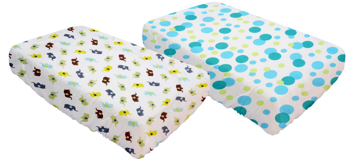
Style 600 : Crib Sheets

100% Micro Polyester for softness Non-slip bottoms Front, waist and leg opening with stainless steel snaps Inherently flame resistant