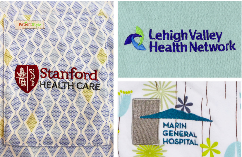
CUSTOM LOGO EMBROIDERY