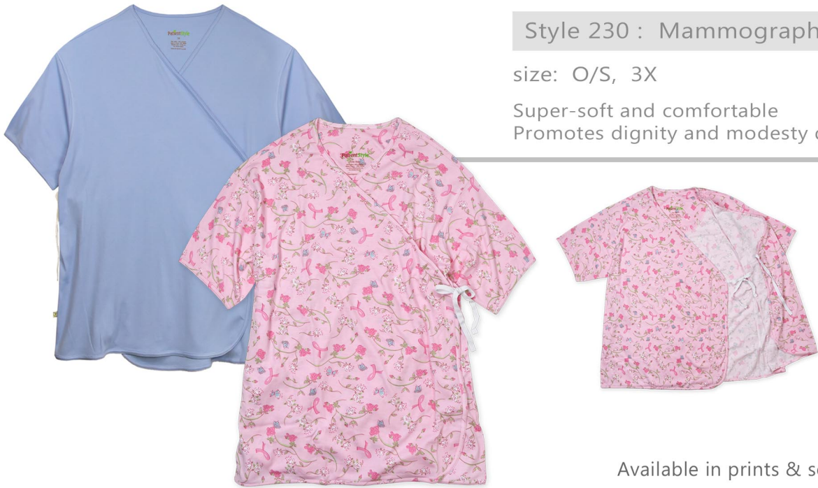
Style 230 : Mammography Top

size: O/S, 3X Super-soft and comfortable Promotes dignity and modesty during screening