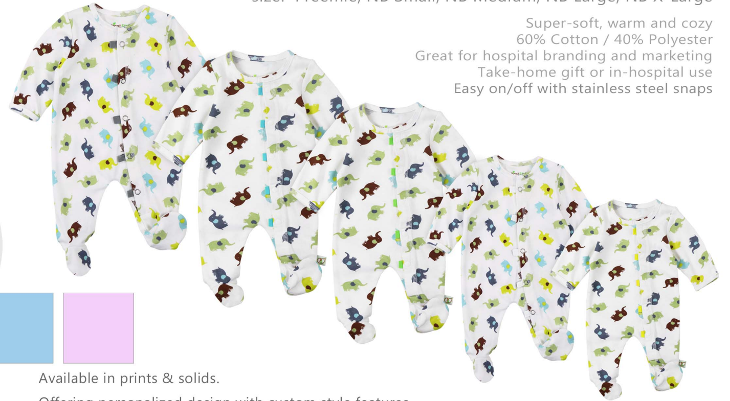
Style 460ST : Infant Sleeper

size: Premie, NB Small, NB Medium, NB Large, NB X-Large