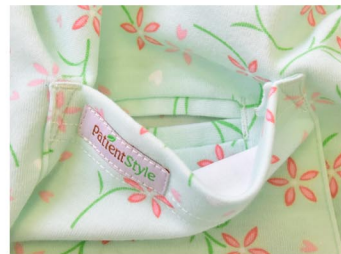
Hidden Telemetry Opening

Patented design Super-soft and comfortable Promotes dignity and modesty Made with and without hood