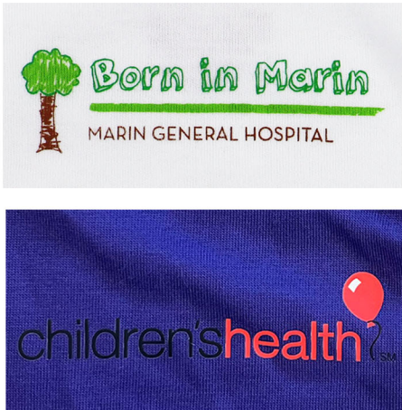
CUSTOM LOGO SCREEN PRINTING