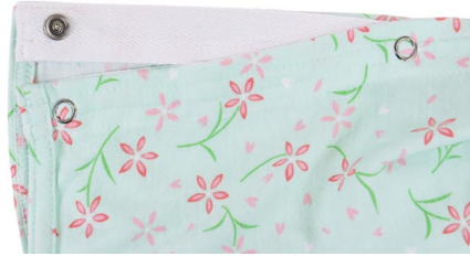
Stainless Steel Snap Style 240ST / 245ST / 245MST