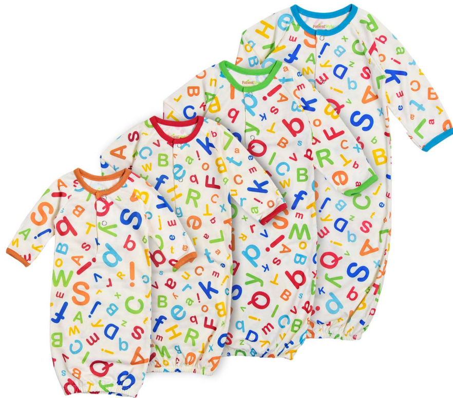
Style 501ST : Infant Gown

Offering personalized design with custom style features, prints, color choices and embroidered or printed logos.