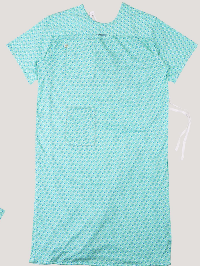
Style 210 : Tie Gown