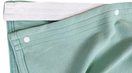
Plastic Snap Style 240 / 245 / 245M