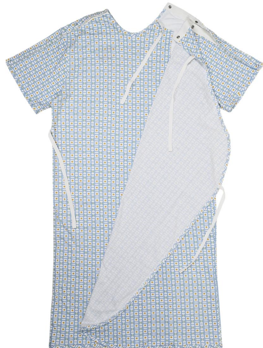
Style 200 / 200ST : IV Snap Gown