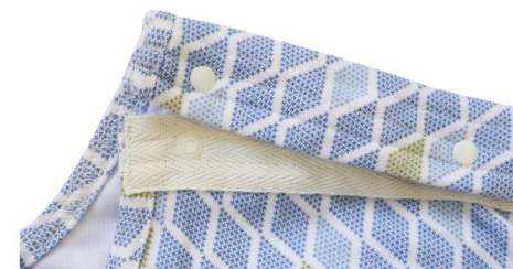
Style 200 : Plastic Snaps