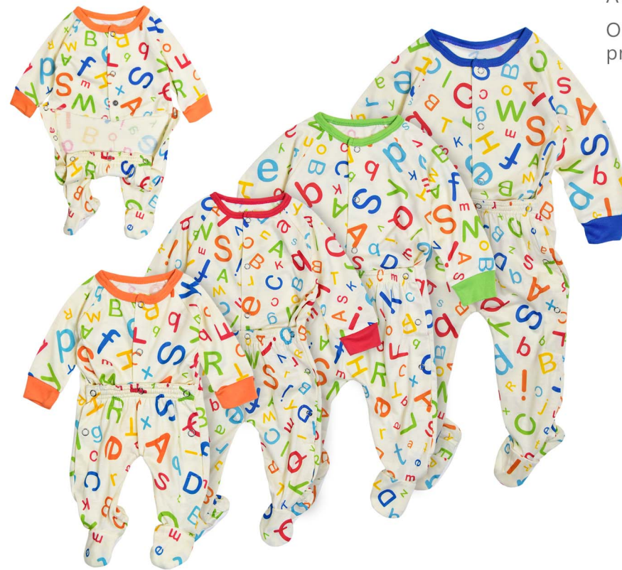
Style 500ST : Infant Footed Pajamas

100% Micro Polyester for softness Hand flaps to protect from scratching Easy on/off with stainless steel snaps Inherently flame resistant