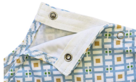
Style 200ST : Stainless Snaps

Available in prints & solids. Offering personalized design with custom style features, prints, color choices and embroidered or printed logos.